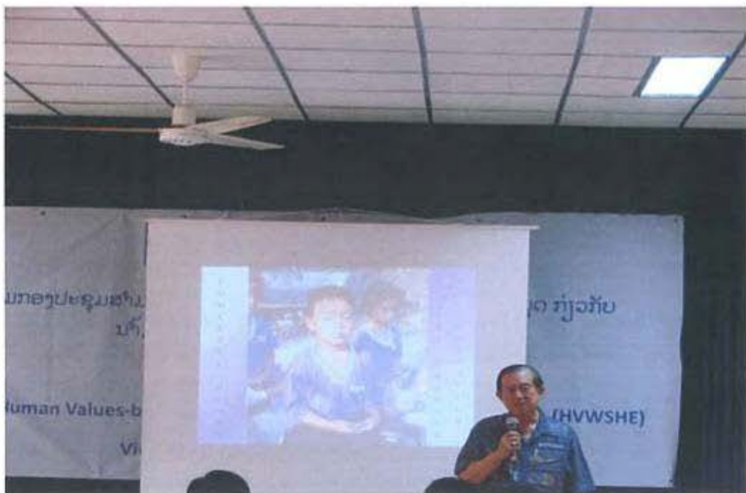
Exhibition at the Resource Center