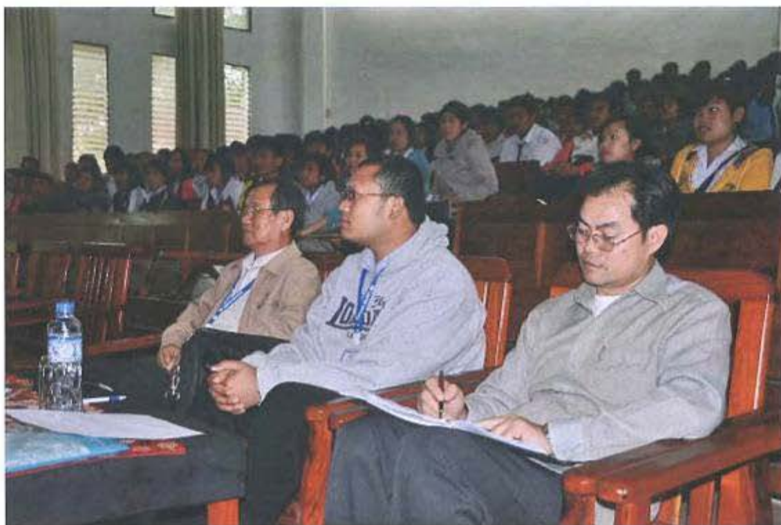
Participants of the Training Workshop