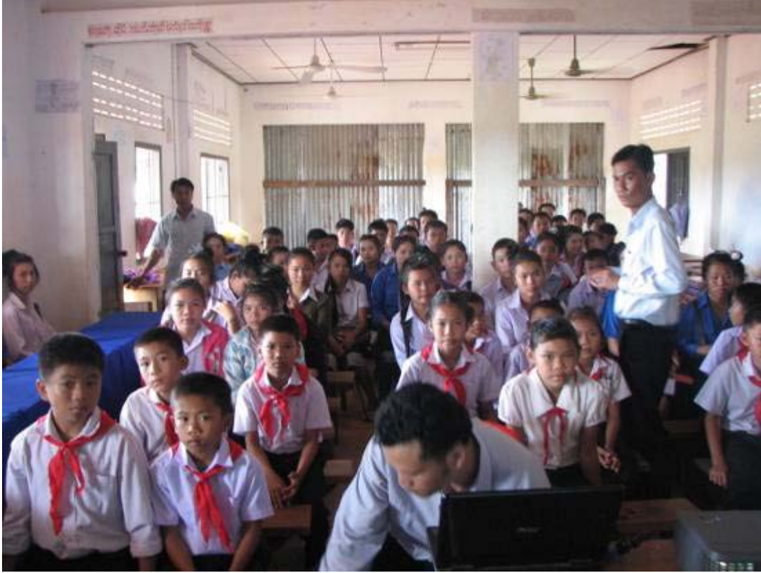
Students in the training in Daensavanh Primary School

Some snapshots took during the training: