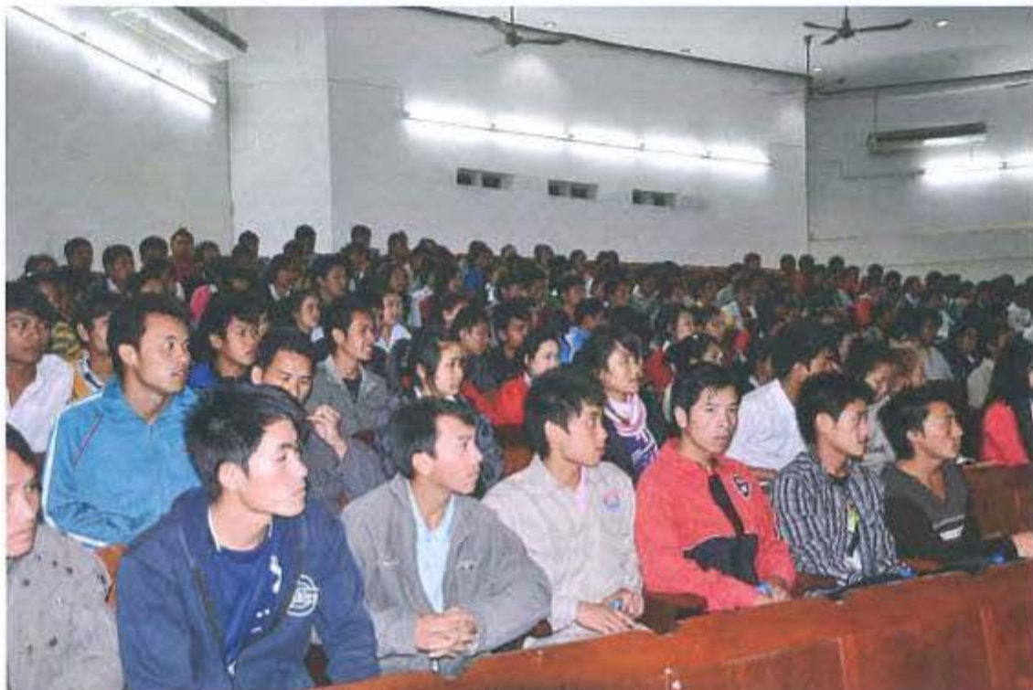
Participants at the Training Workshop