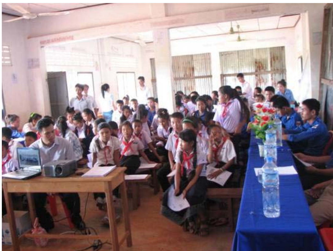
Students and teachers participants in the training