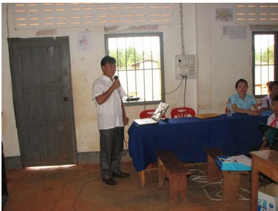
Director of Nampapa department of Bolikhamxay Province sharing his ideas about human value based water and sanitation