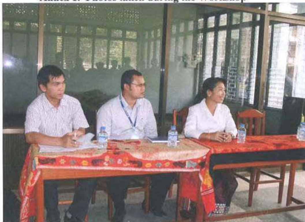
Opening of the Workshop